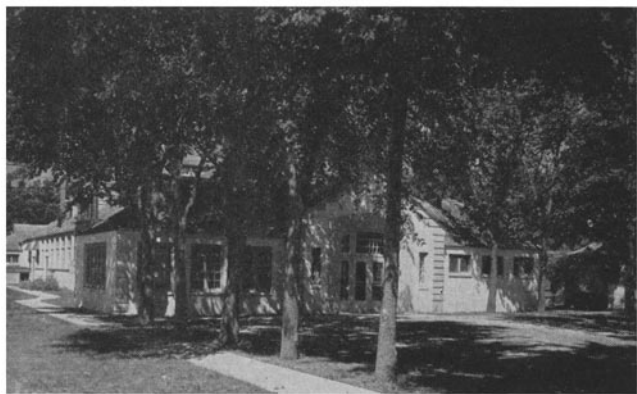
HORMEL GRADUATE SCHOOL —This was established by the University of Minnesota in 1942 and is located in a beautiful natural setting east of the city of Austin.